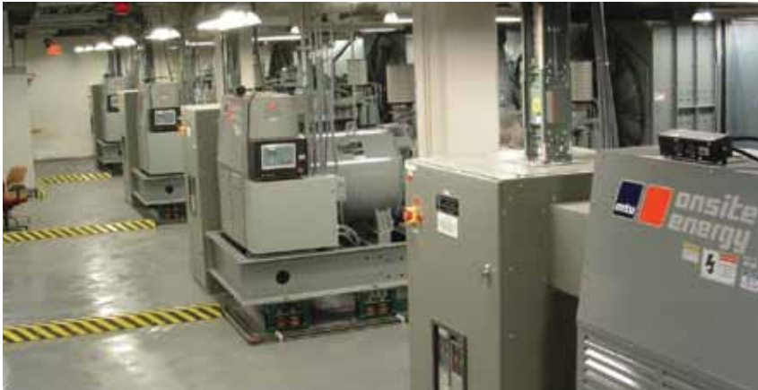
Inland Power Group has upgraded a telecommunications and data storage facility near Chicago, Ill., with four 1000 kW diesel-driven generator sets from MTU Onsite Energy.