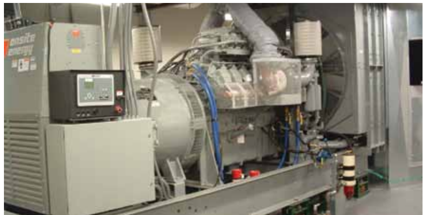
The MTU Onsite Energy gen-sets installed at the data center facility are powered by a 31.8 L, 16V 2000 MTU engine rated at 1495 hp coupled to a Marathon Electric alternator.

1000 kW MTU Onsite Energy diesel-driven generator sets supplied by Inland Power Group, taking the total power of the facility to 4000 kW. The MTU Onsite gen-sets are powered by a 31.8 L, 16V 2000 MTU engine rated at 1495 hp coupled to a Marathon Electric alternator.